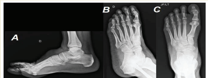
Figure 1: Right foot radiographs in lateral (A), oblique (B) and posteroanterior (C) views without alterations.

Magnetic resonance imaging of the right foot and ankle showed a lesion with heterogeneous signal located superficially to the extensor tendons of the fingers, close to the subcutaneous cellular tissue of the dorsal surface, measuring 2.6 x 2.1 x 1.5 cm, determining dorsal skin bulging, associating if swelling in adjacent soft tissues. This lesion presented hypersignal on