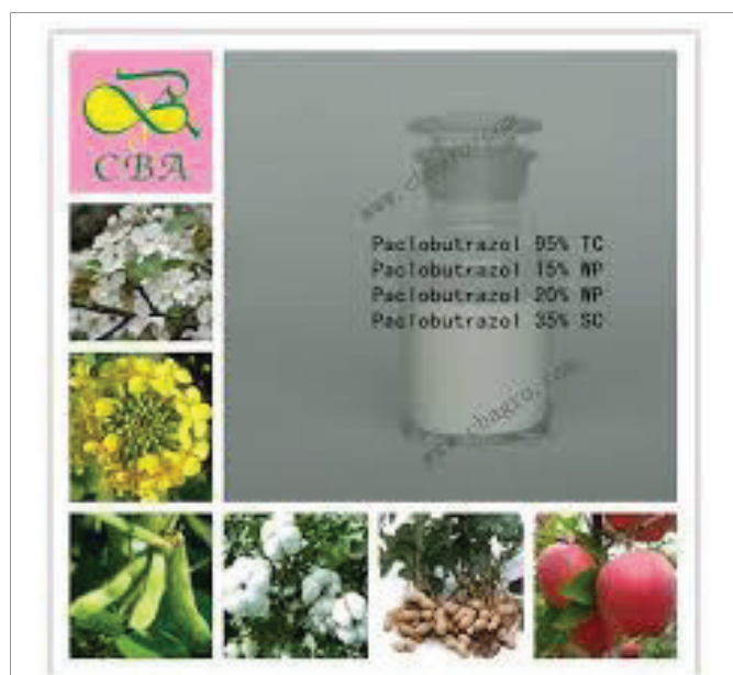
Figure 3.4: [Paclobutrazol (PBZ), [2RS, 3RS]-1-[4-chlorophenyl]-4, 4-dimethyl-2-(1H-1, 2, 4-triazol-1-yl) pentan-3-ol]

The fruit set was increased in paclobutrazol treated trees @ 1500