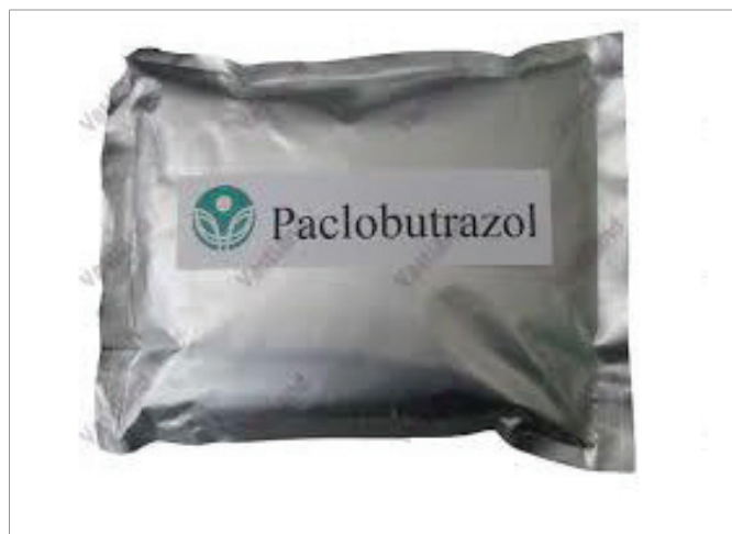
Figure 2: Paclobutrazol (PBZ) packaging in dust Form.

PP333 treatment in peach and nectarine, respectively. Lever, et al. [29] found more than 50 per cent reduction in shoot growth of Red Delicious apple following PP333 foliar spray at the rate of 750 ppm. However, the effectiveness of PP333 varied with the dose, time, and method of application. Irving and Pallesen [30], found that on two-year-old apple 1000 ppm of PP333 had extraordinarily little effect on vegetative growth and remained effective up to 82 days of application. But Stinchcombe, et al. [31], reported that, in Cider apple, PP333 at 2000 ppm remained effective in the following year also. ElKhoreiby, et al. [32], recorded maximum retardation in growth when PP333 was applied 21 days after petal fall.