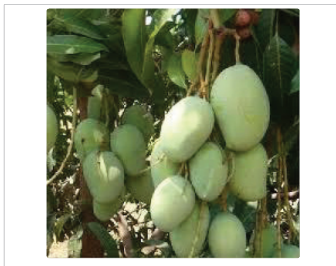
Figure: Mango (Fruit Growth and Quality)

Paclobutrazol inhibits gibberellins biosynthesis by blocking the conversion of kaurene and kaurenoic acid,